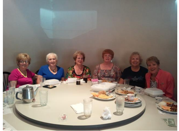
Lunch Bunch at Wonderful Chinese

Last month we had a wonderful time at Wonderful Chinese . Here's a picture from that lunch; we hope you'll join us this month!