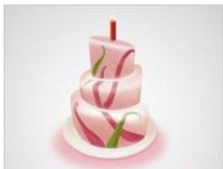
Happy Birthday Cake