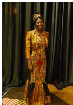
Isn't She Beautiful?